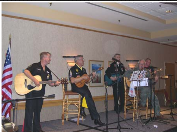
BANQUET ENTERTAINERS LET LOOSE