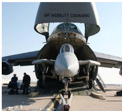
Christine arrives (Somebody's got pull!)

Registration is on www.facmuseum.org or www.ov-10bronco.net These guys know how to throw a party! Phantom Society reunion is also involved, including the Luftwaffe in America. You F-4 guys can get double the pleasure. The growing FAC Museum display includes not only OV-10s, O-2s, “Scooby” (QF-4), “Christine” (historic F-14), a movie star F-5 (Top Gun), but four new surprises arriving before FACtoberfest. Pssst...rumor is that a TF-102, TA-4, A-7B, and an F-105 could be involved! Come see ‘em.